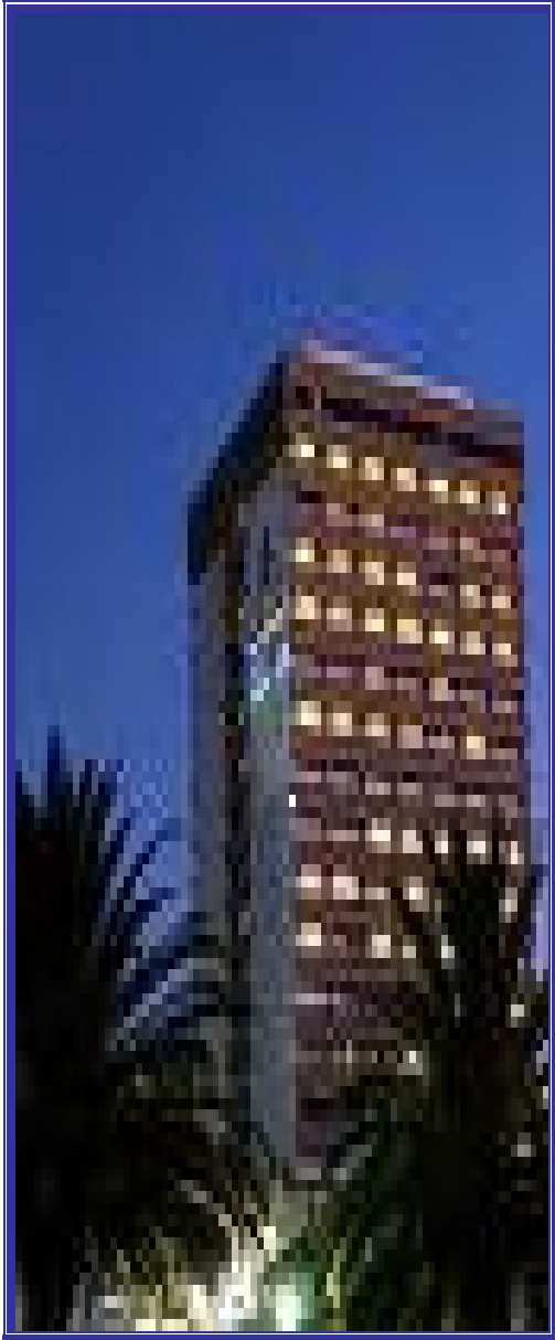
Prime offices in Windhoek